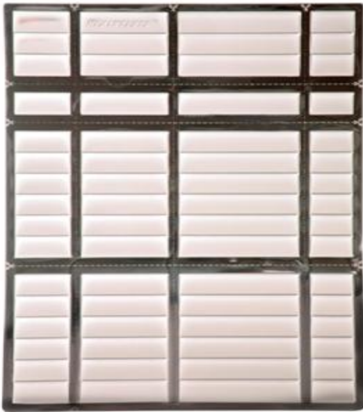
Without Reflexive Foil